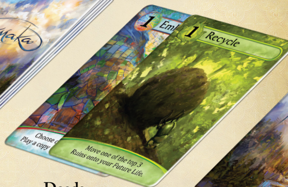
Deeds Player A