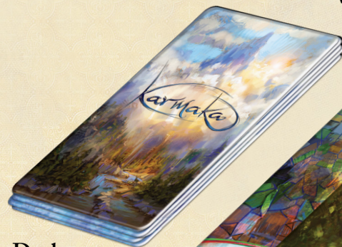
Deck Player A